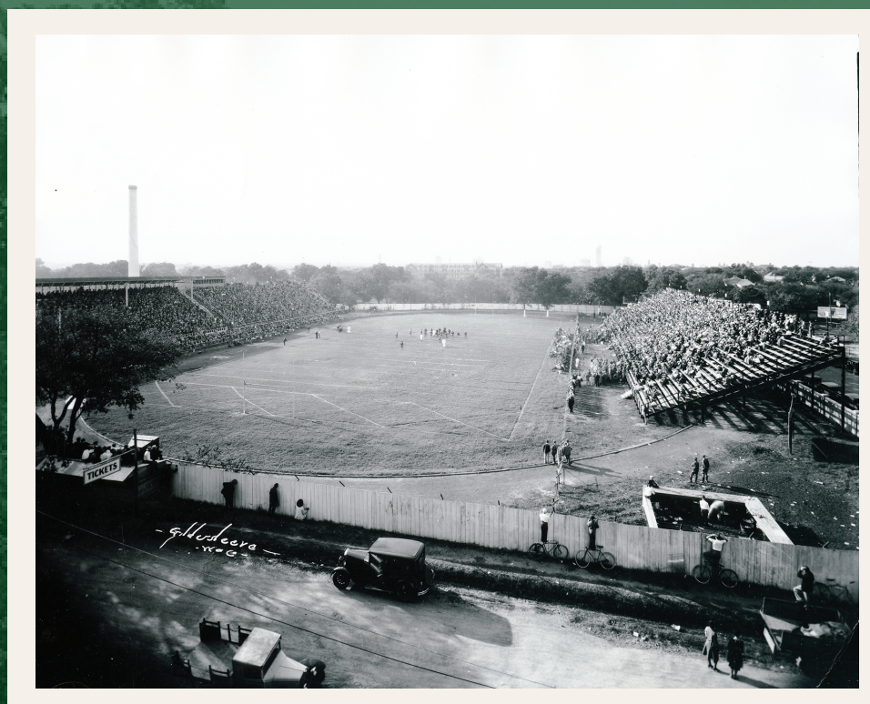
Crowds at a football game, Carroll Field, ca. 1930s