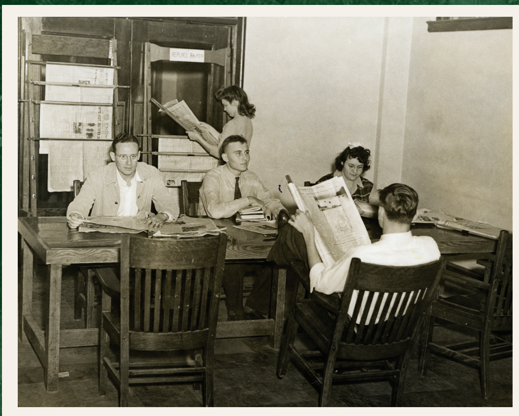
Students reading the daily newspaper, ca. 1930s