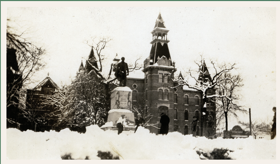
A snowy day on Burseson Quadrangle, ca. 1930s